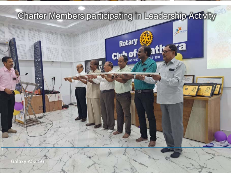
Galaxy A53 5G