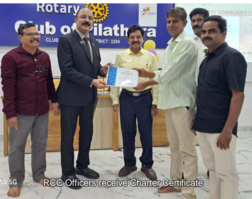
RCC Officers receive Charter Certificate