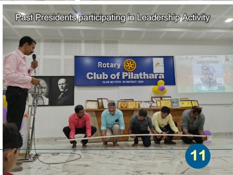
Past Presidents participating in Leadership Activity