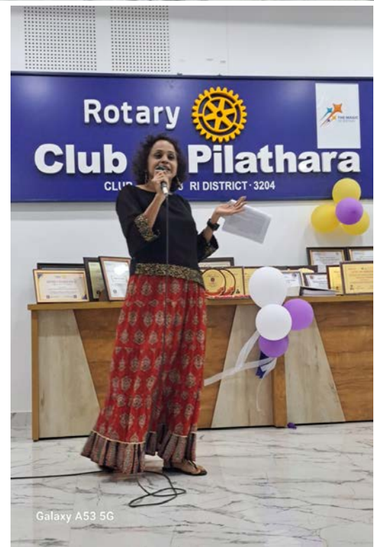
Galaxy A53 5G