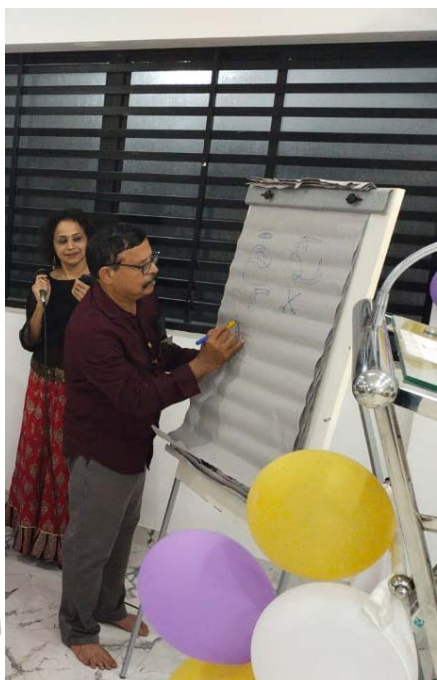
Entertainment / Games for Members and Families