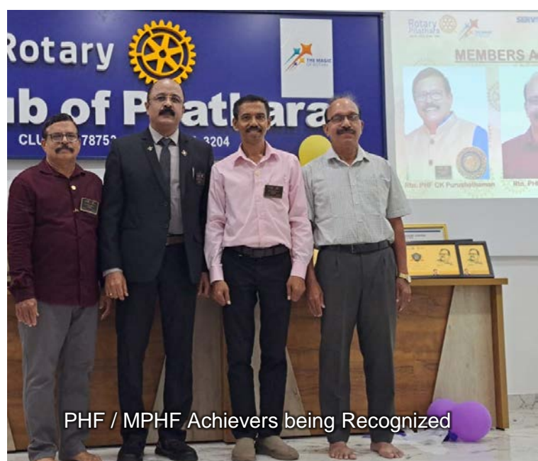
PHF / MPHF Achievers being Recognized