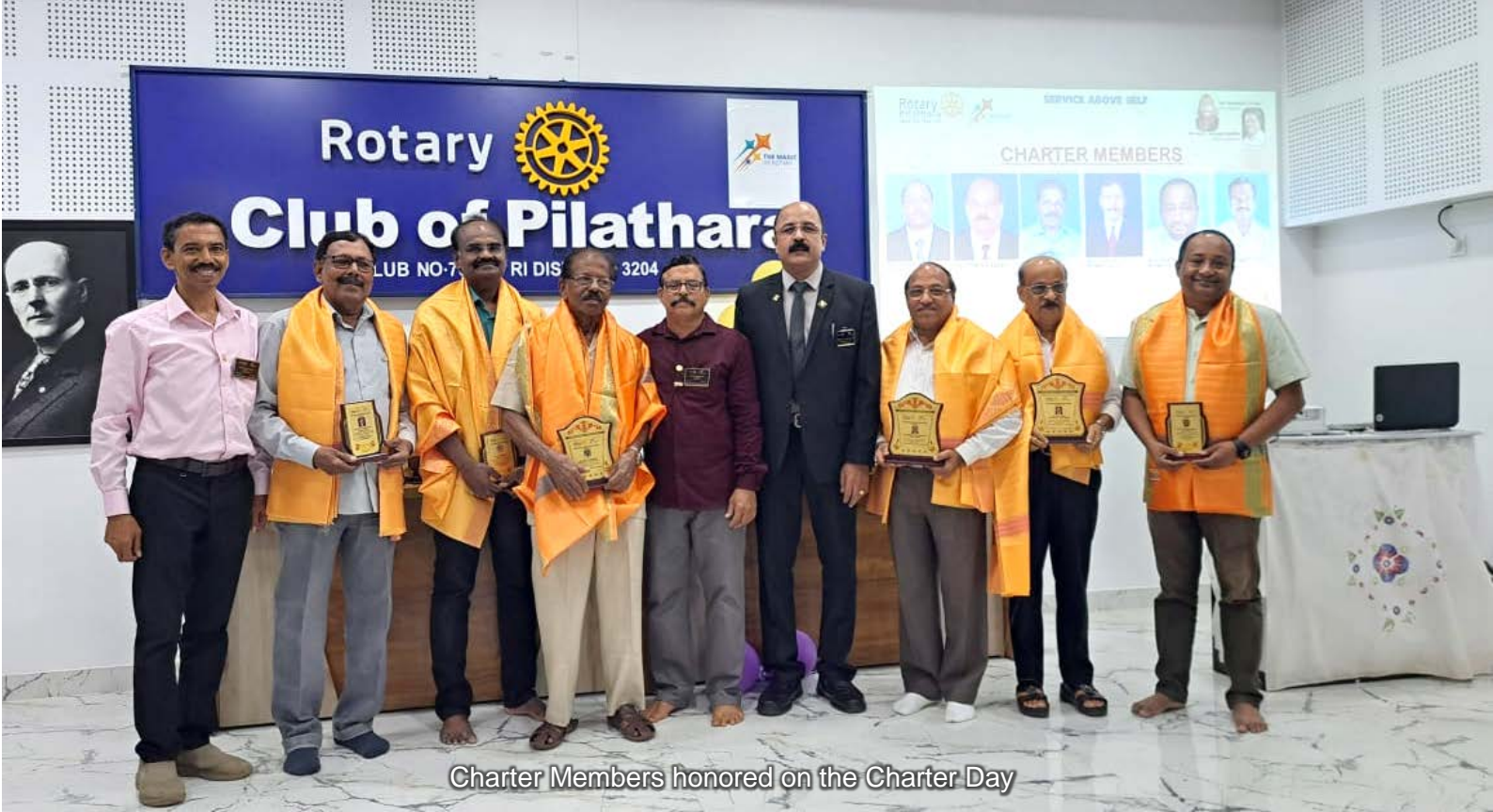
Charter Members honored on the Charter Day