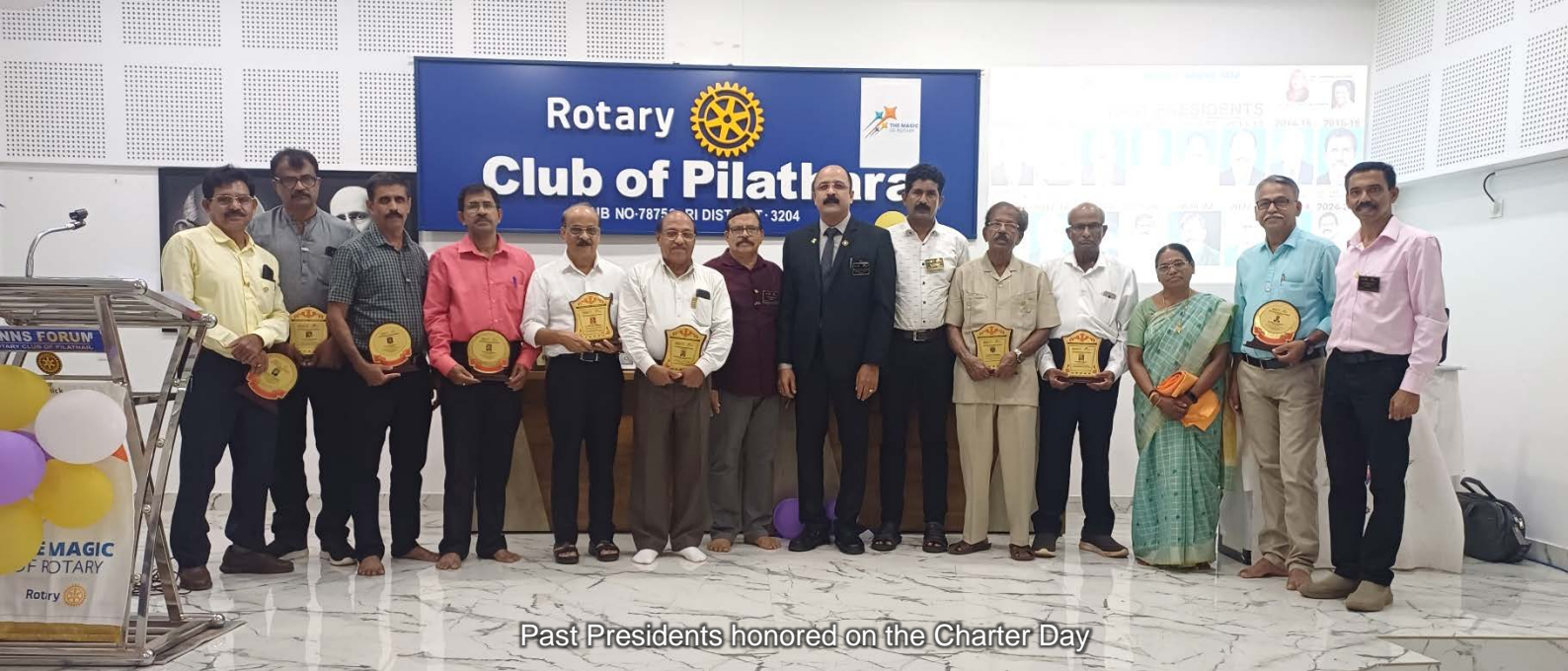
Past Presidents honored on the Charter Day